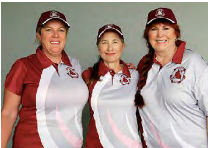
Queensland Women's Team