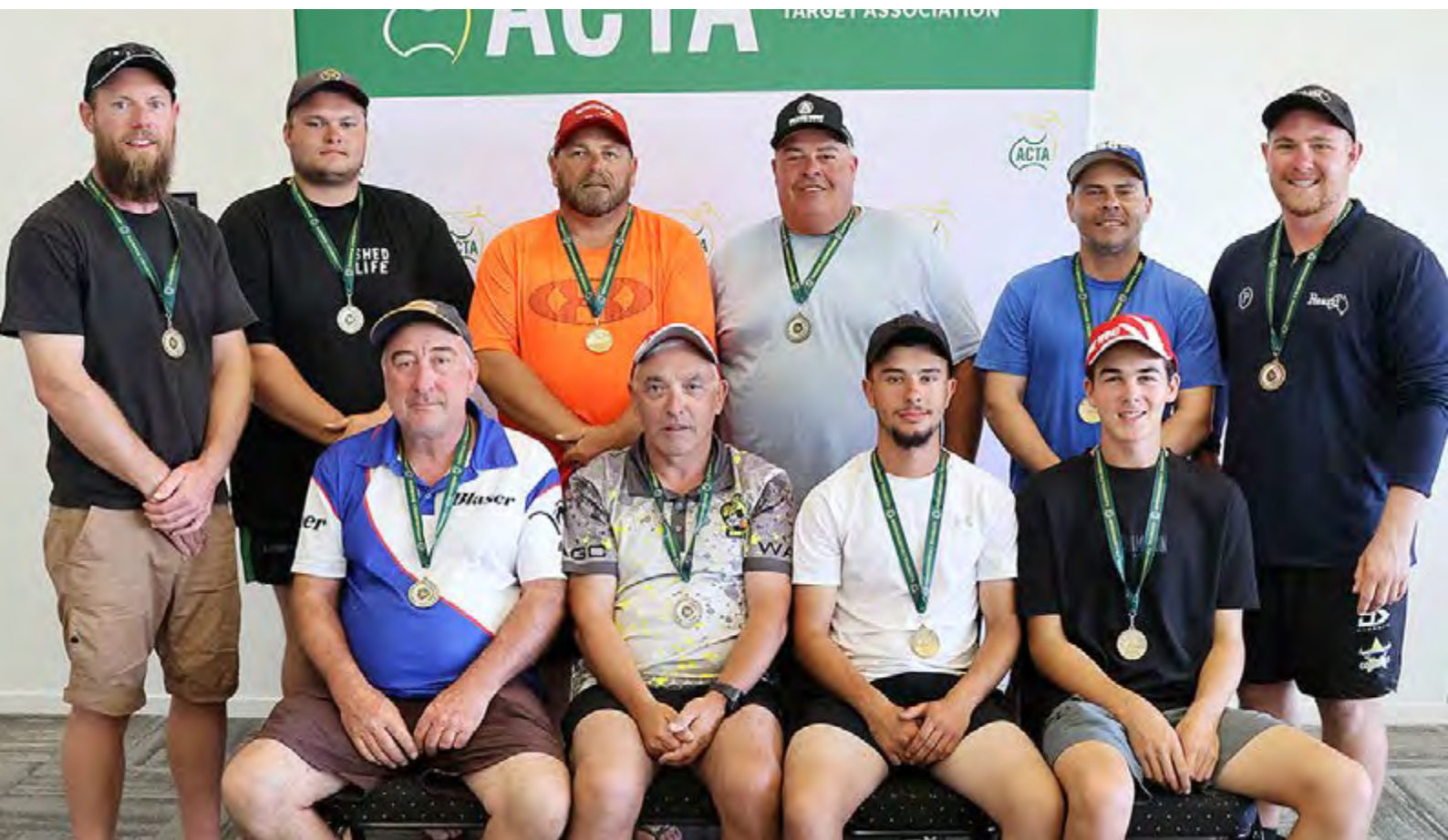
All Australian Team