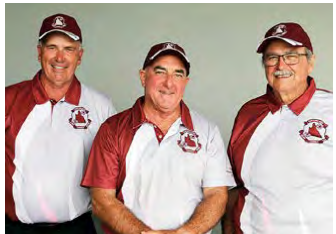
Queensland Veteran Team