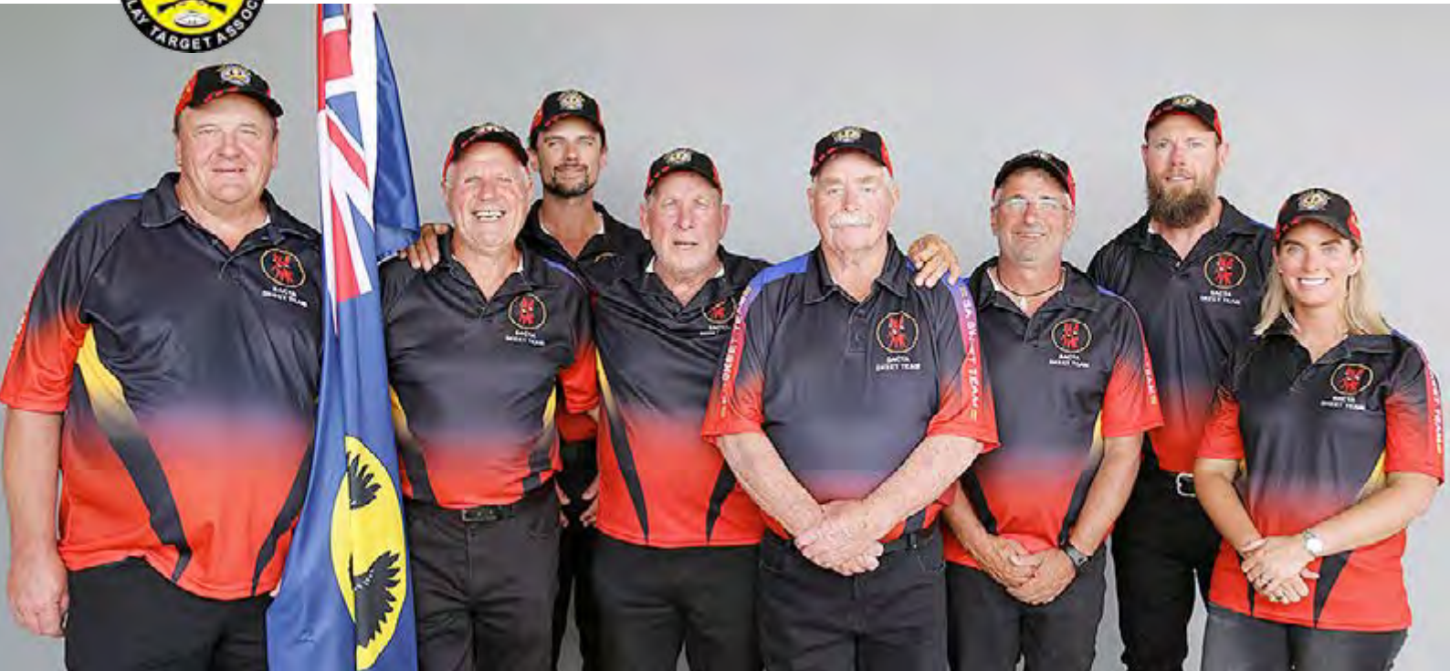
South Australian Combined Team