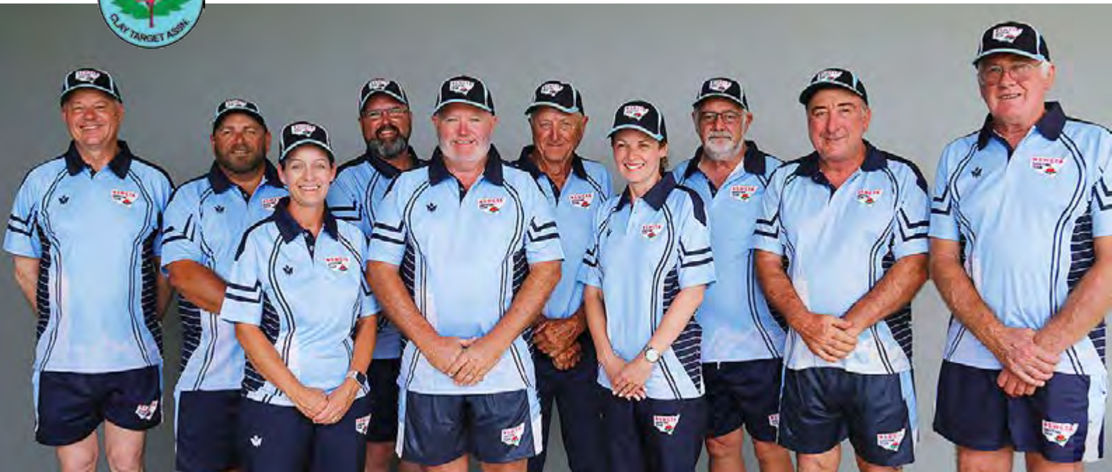
New South Wales Combined Team