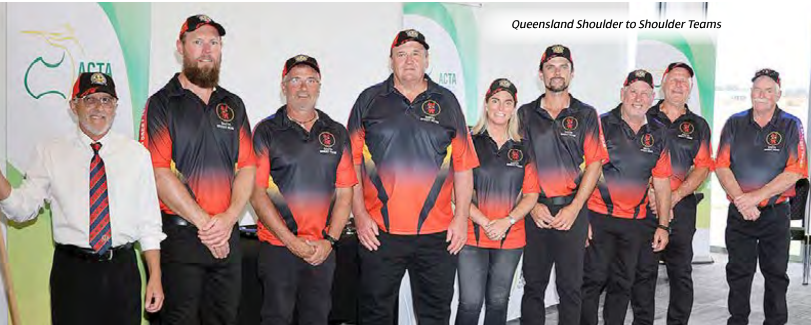
Queensland Shoulder to Shoulder Teams