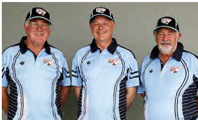
New South Wales Veteran Team