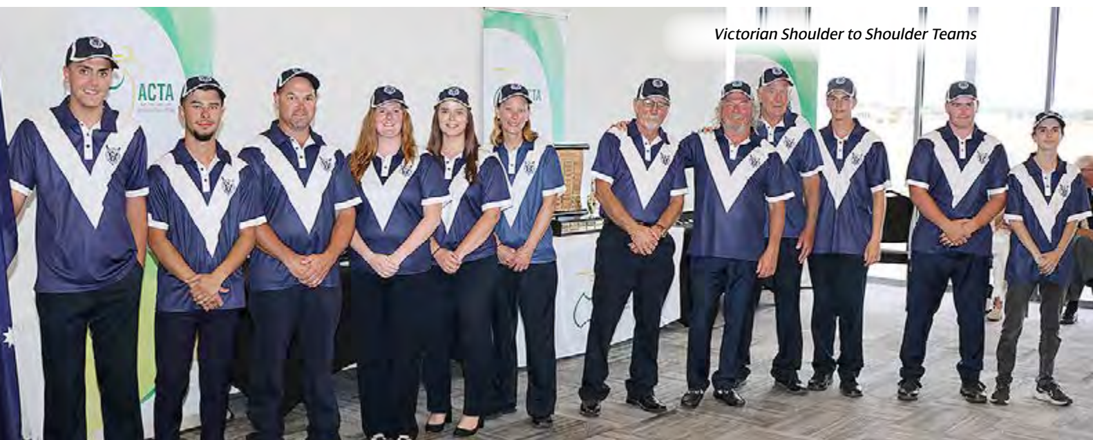
Victorian Shoulder to Shoulder Teams