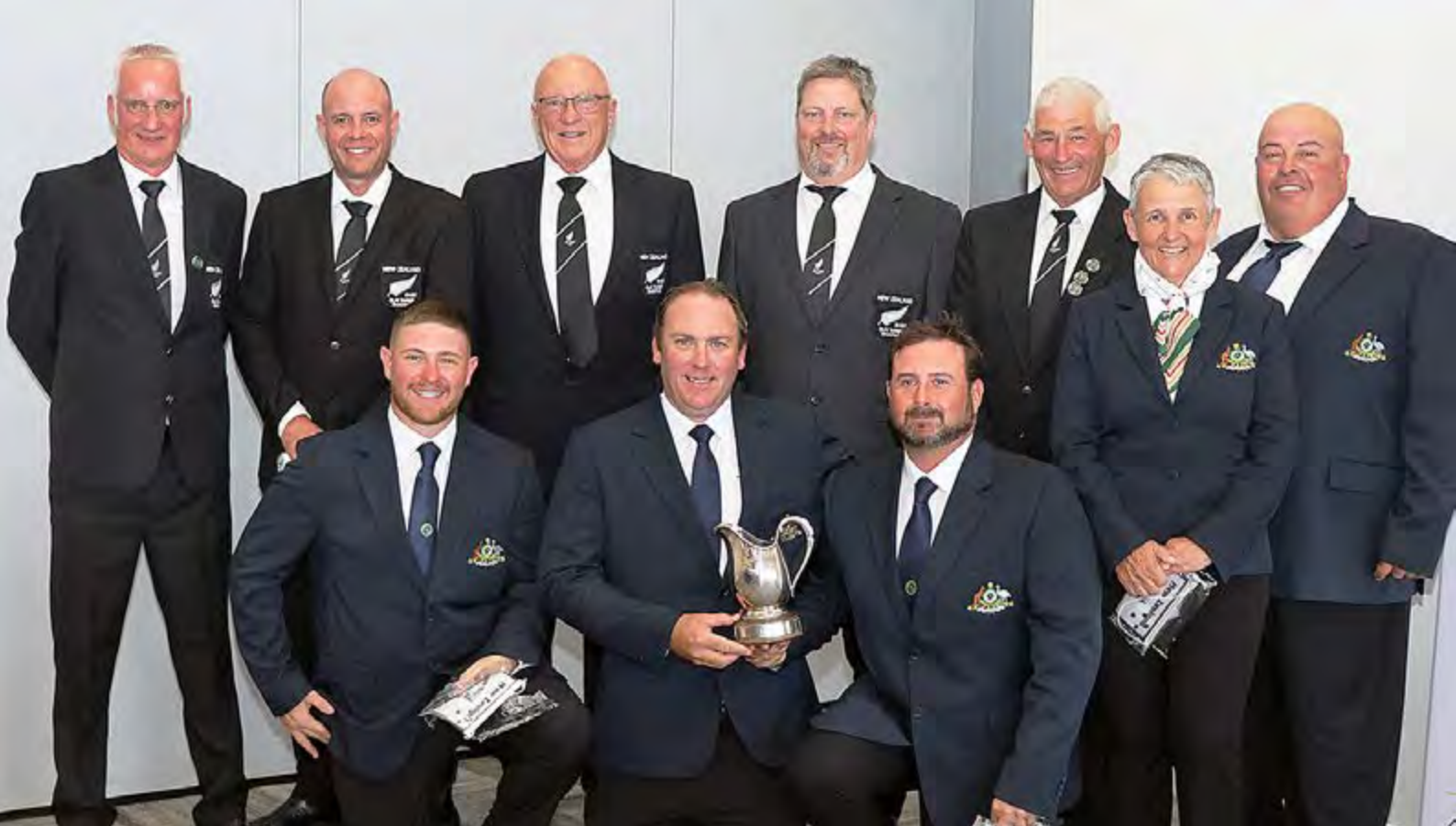
Australian and New Zealand Glenn Trophy Teams