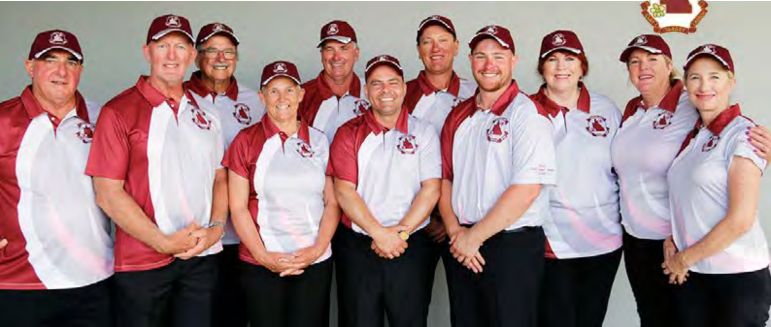
Queensland Combined Team