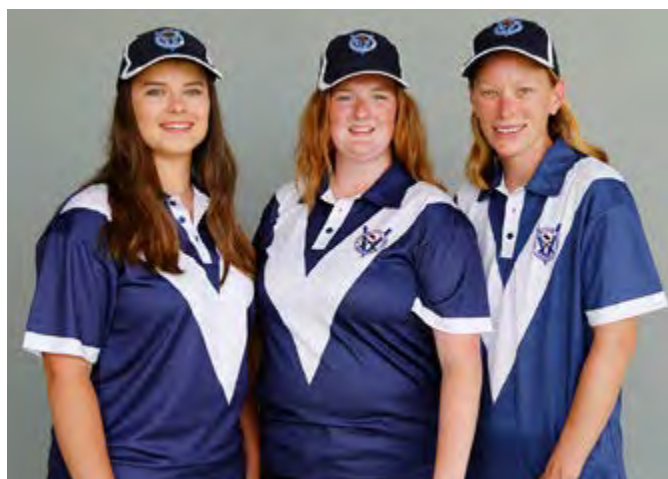
Victorian Women's Team