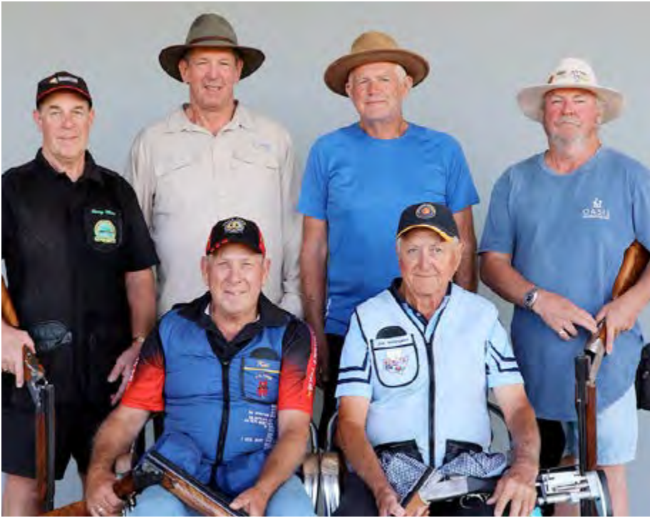
Australia/New Zealand Postal Challenge Veterans Team