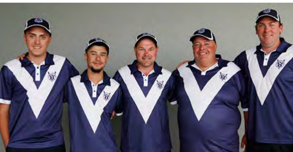
Victorian Open Team