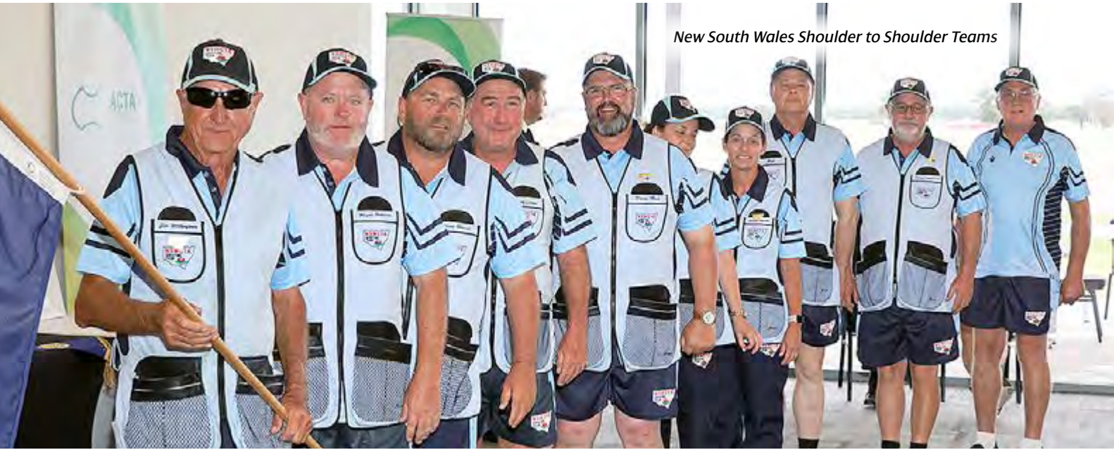
New South Wales Shoulder to Shoulder Teams