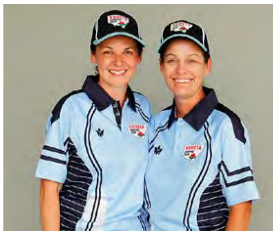
New South Wales Women's Team