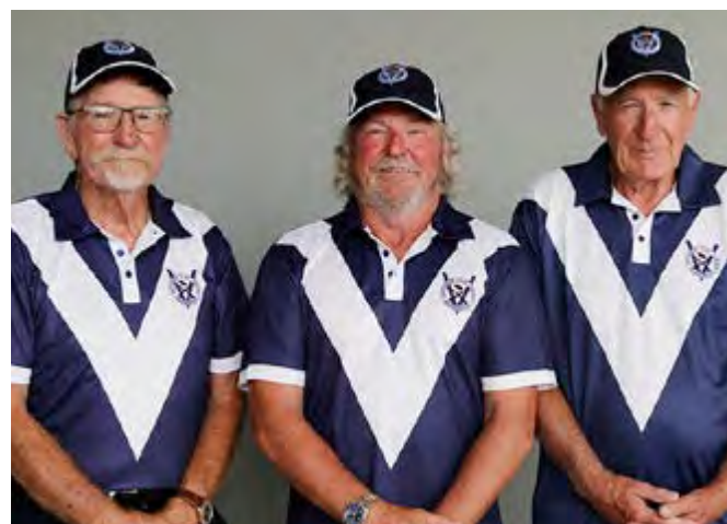
Victorian Veteran Team