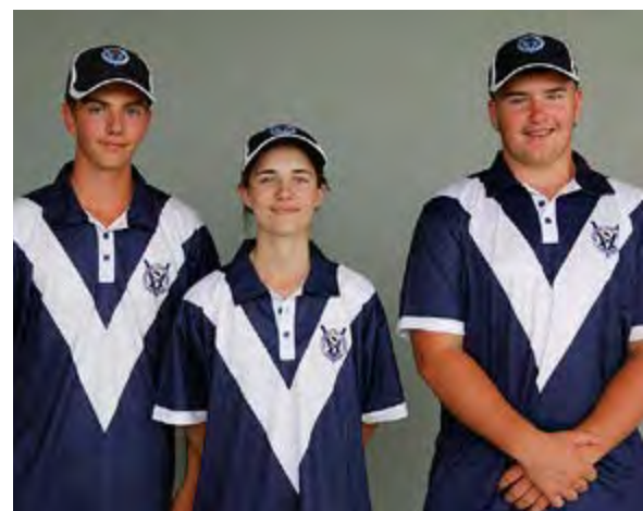
Victorian Junior Team: No Junior Competition for 2024