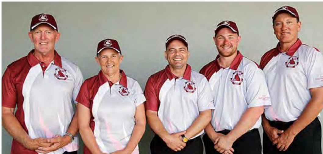
Queensland Open Team