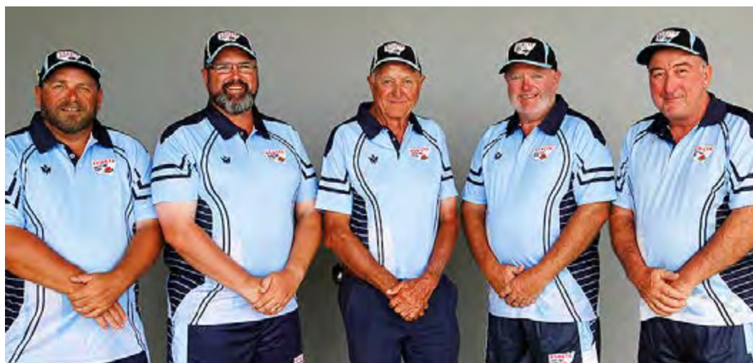
New South Wales Open Team