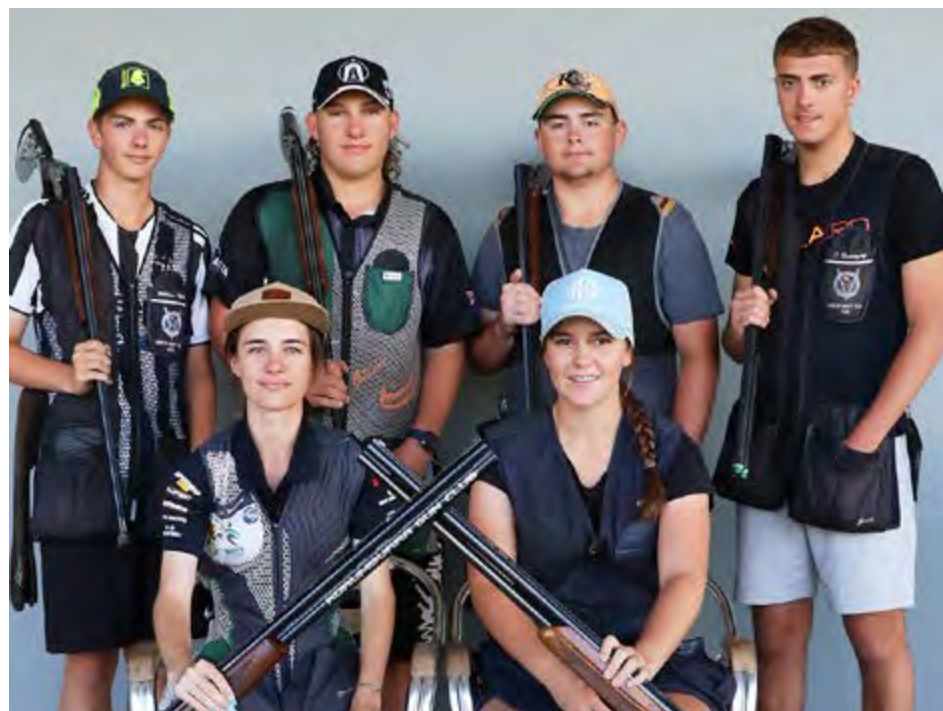
Australia/New Zealand Postal Challenge Junior Team