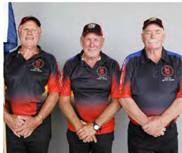
South Australian Veteran Team