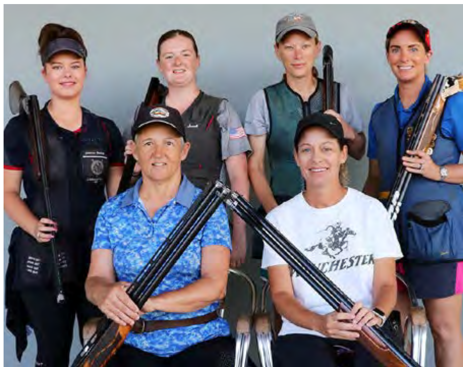
Australia/New Zealand Postal Challenge Womens Team