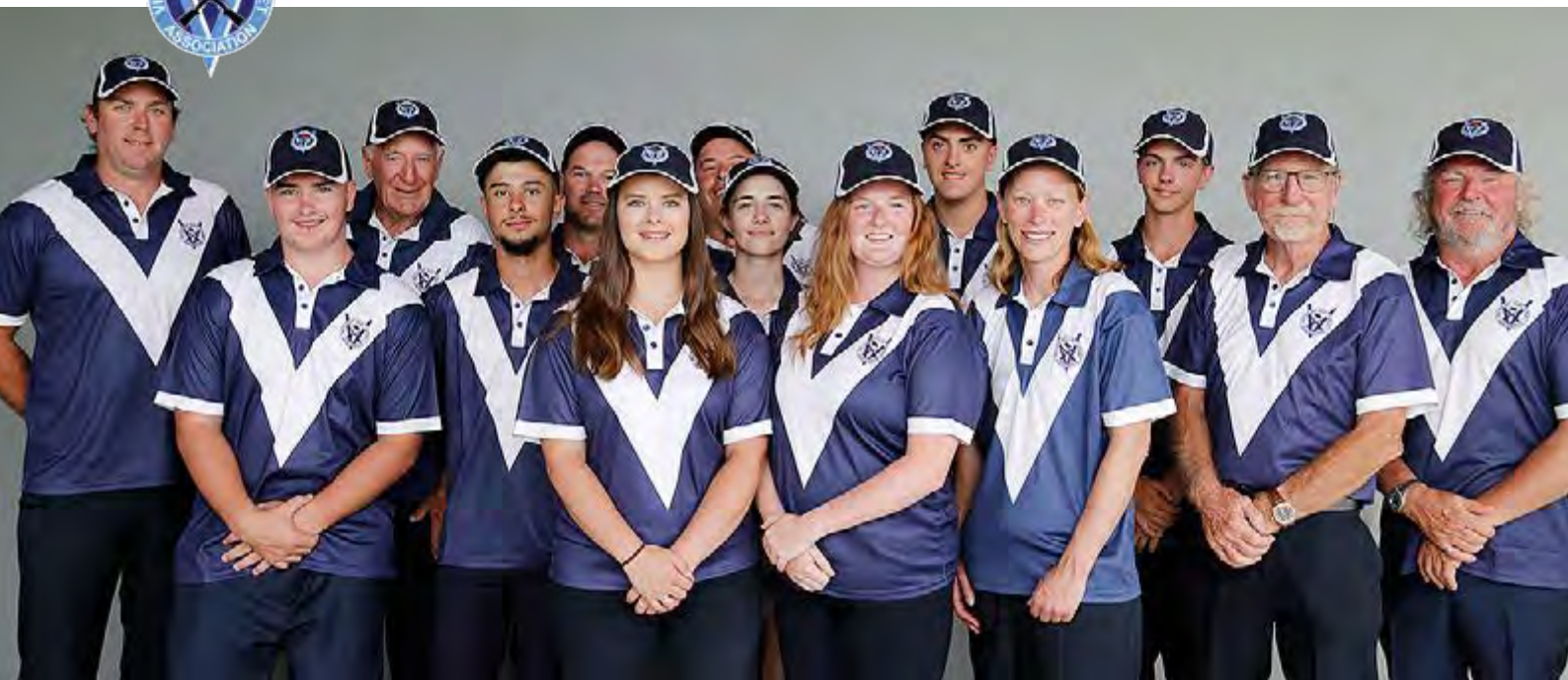
Victorian Combined Team