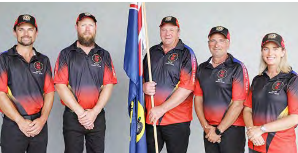
South Australian Open Team