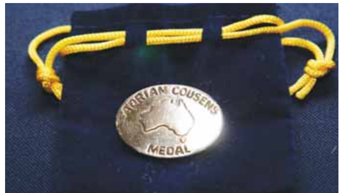
The Adrian Cousens Medal