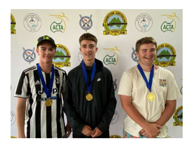
VICTORIAN ZONE CHAMPIONS NORTH EAST ZONE