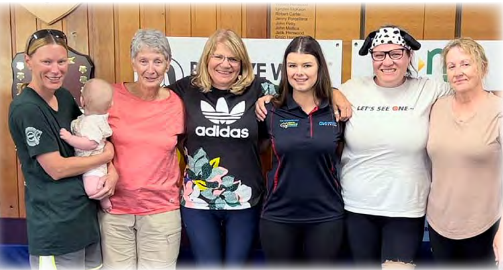
Ladies Postal Team