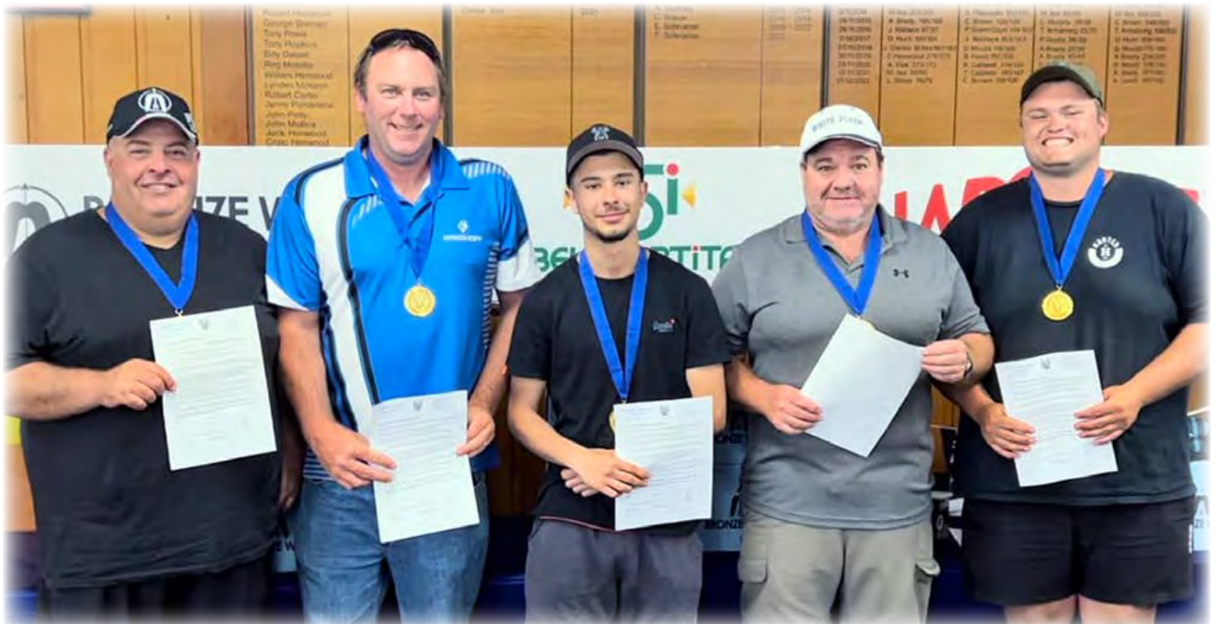
Open Shoulder to Shoulder Team

Well done to all shooters selected to represent Victoria at the Skeet Nationals in Wagga Wagga in March. We are sure you will do well and represent the State with pride. Thank you to everyone who helped make this a great carnival and special thanks goes to our sponsors Bronzewing Australia and Bendigo Bank Mooroolbark!! Without their support this event would not happen. We will see you all at Frankston in 2024!!