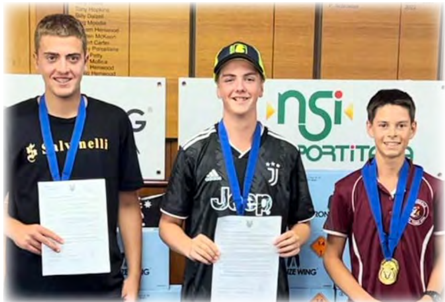
Junior Shoulder to Shoulder Team