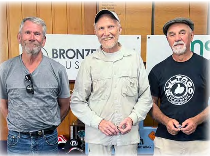
Veterans Postal Team