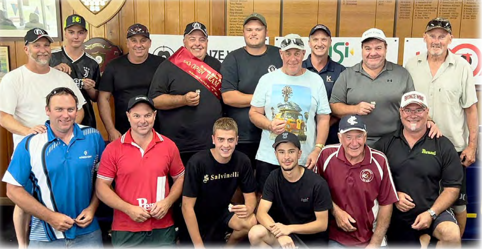
Open Postal Team