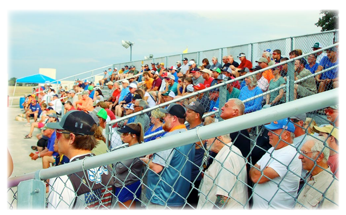
Watching from the stands

A huge thanks to the ACTA for continuing to fund the Skeet Team and a huge congratulations to all of the Australian Team members for their dedication, determination and ability to Make Australia Proud!