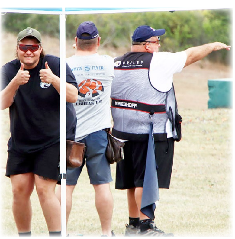
Aussies on the practice field

The World Championships are broken down into the Mini World and the Main World. The Mini World is essentially a warm-up event with Doubles shot on Friday and then on