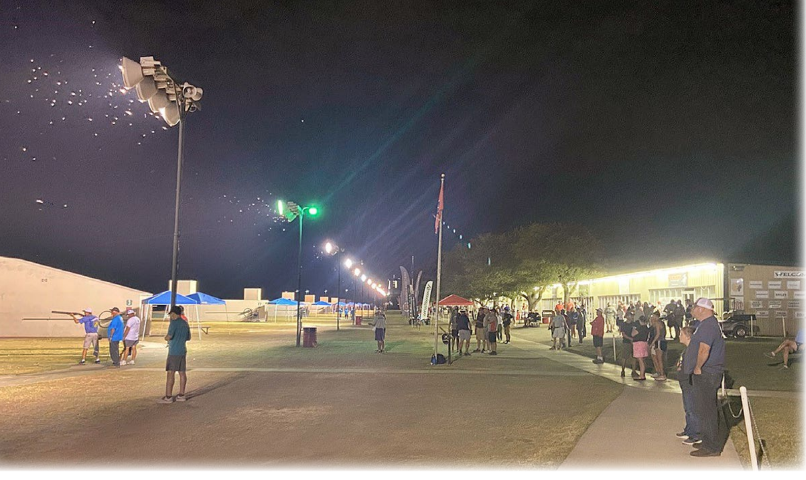
Shoot-off fields under lights

Australian team members, bode well for the main World Championship events.